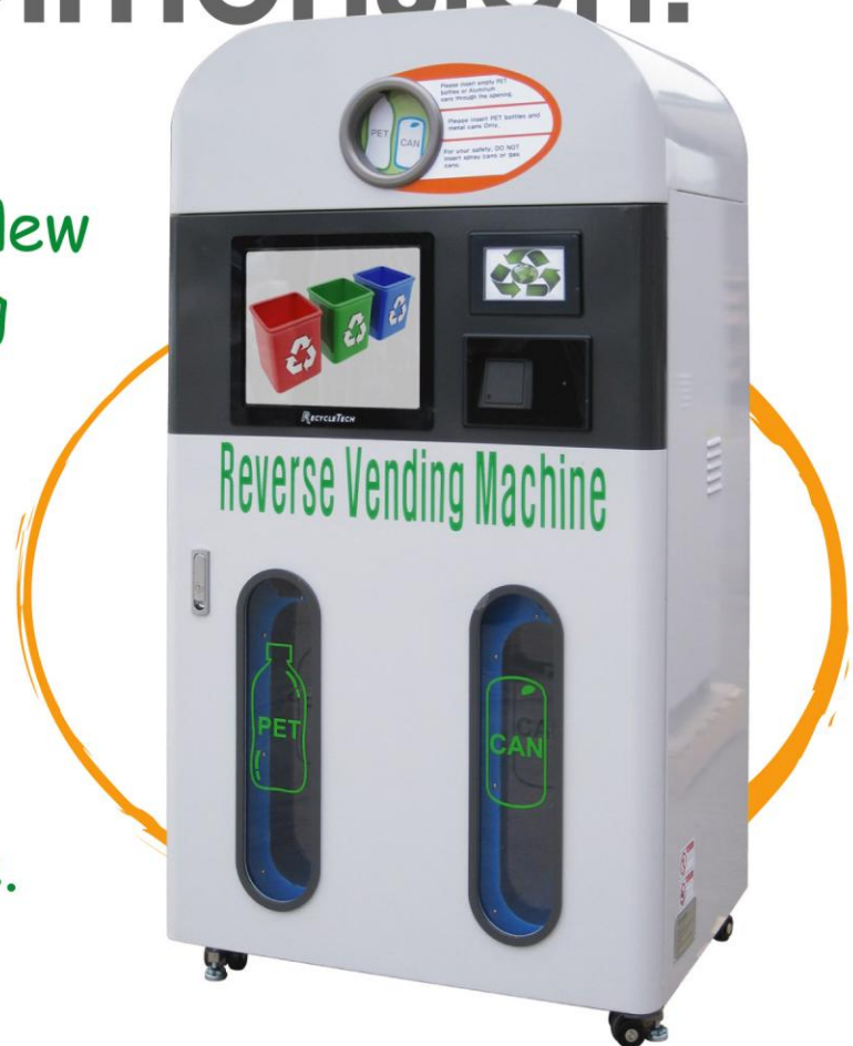
MT400C Beverage Container Sorter / Compactor